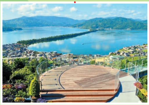
View from Kasamatsu Park