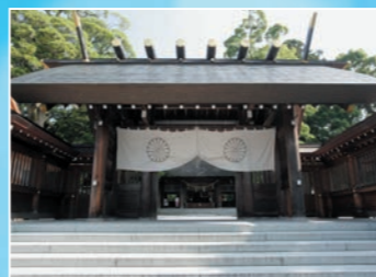
Motoise Kono Shrine

According to legend, Amanohashidate used to be a ladder for the god Izanagino Omikami to come down from heaven to visit the goddess Izanaminno Omikami at Manai Shrine. However, the bridge fell down to earth and became the Amanohashidate that is seen today. Five colored ball decorations called "Suedama" can be seen on the balustrade of the shrine's main building. These "Suedama" decorations are very rare and can only be seen at one other location-Ise Jingu in Mie Prefecture.